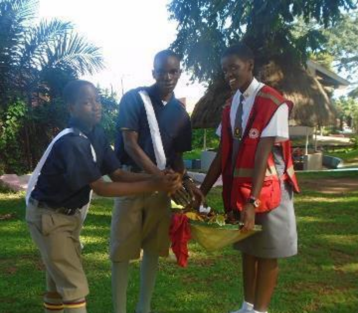
Mengo Senior School students cleaning the Sanyu compound

We offer a number of ongoing opportunities to come and volunteer at Sanyu. On site is our guesthouse, which provides each volunteer with a comfortable and safe place to stay while being steps away from the babies' home. Please check our website for more information. www.sanyubabies.com