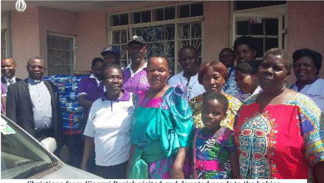
Christians from Kisaasi Parish visited and donated goods to the babies.