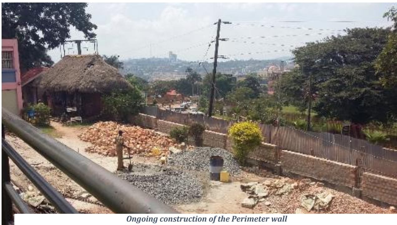
Ongoing construction of the Perimeter wall

The construction of a perimeter wall has been a project that Sanyu Babies Home has wished to undertake for a very long time and is now finally underway! Complications arose at first when trying to obtain planning permission to actually build the wall and then also to construct a temporary iron sheet fence around the compound whilst the wall is being built. However, the building finally got underway half way through May. It is very exciting to see the workers hard at work, to build a wall to keep all of the children and staff safe here at Sanyu Babies Home. Although the children's play area has been reduced for their safety so they are not close to the construction workers, children like to stand and watch the construction workers shouting "Man-ey, Man-ey". The project was originally anticipated to take 2 months to complete however it may take longer due to the large area of the compound. We send a special thank you to all our dear donors for donating goods- in- kind and money towards the construction of the wall. Any donation towards the completion of this wall would be greatly appreciated so we can finish this project well.