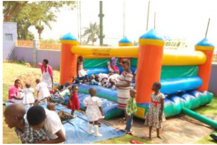
The children and staff play at the bouncing castle