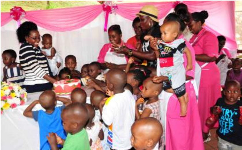
The children and staff cut the Christmas cake