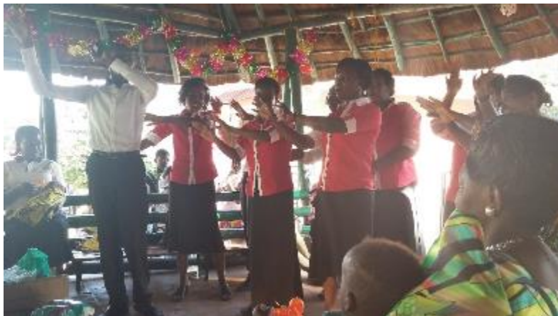
Kibuye Echoes Choir

When the choirs arrived, they split up in groups helping with the compound cleaning, bathing children, cooking, doing laundry and feeding babies. This helped the staff to quickly finish their chores so they can all get to enjoy the carols.