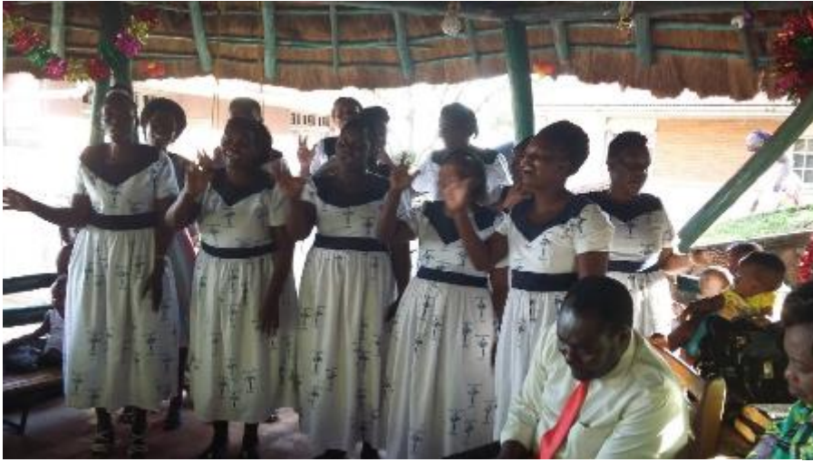
Mary Sumner Choir- Namirembe Diocese

On Friday 23 rd December 2016, we were blessed to have four choirs visit us to sing Christmas carols for the Sanyu babies, staff and volunteers. Despite the business of the Christmas season we were blown away by the generosity of these choirs! They chose to use their valuable time to come and serve us when they could have chosen to sing for large churches, family events or just spend time with their loved ones instead but we are very grateful to God that they chose to spend time with us and bless us this season! These included Kibuye Echoes Choir, Mary Sumner Choir-Namirembe Diocese, Disciples Choir-