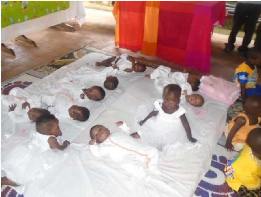
Babies ready for the baptism service