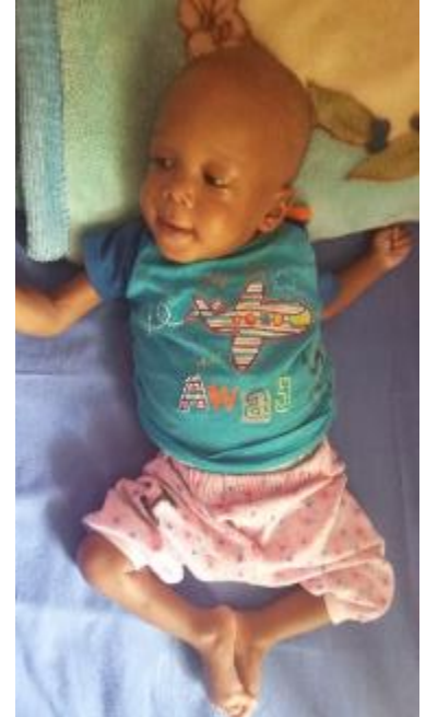
Prince on arrival