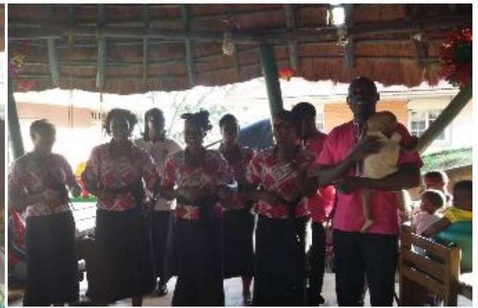
Saints Choir from Mutundwe

Sanyu Babies' Home, P.O. Box 14162, Mengo, Kampala, Uganda Tel: +256 414 274 032 Mobile+256 712 370 950/ +256 705 681 603 Email: sanyubabhome1@yahoo.com Website: www.sanyubabies.com "Let us not become weary in doing good, for at the proper time, we shall reap a harvest if we do not give up" (Galatians 6:9)